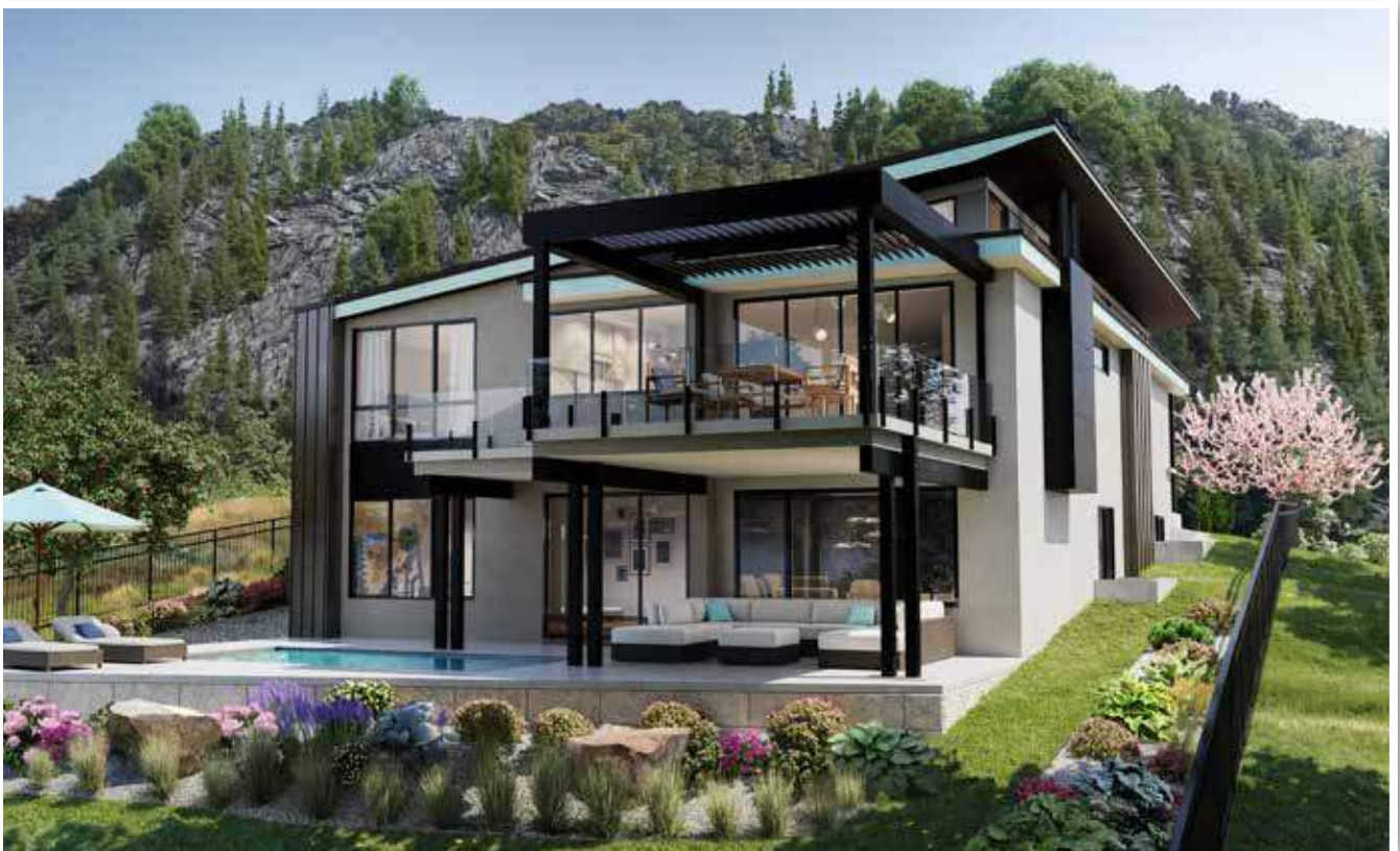
All images in this document are a representation of The Benches and intended for inspiration only. Finished product may differ.